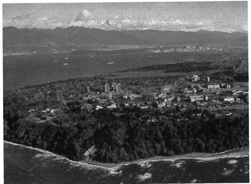
Recent aerial view of the UBC campus.