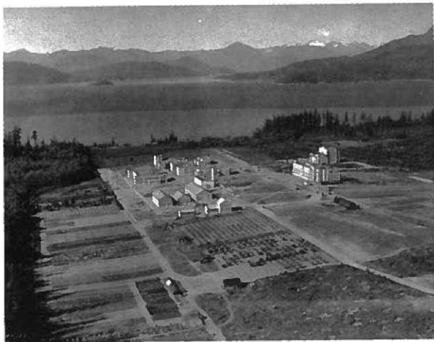
Aerial view of UBC's campus in 1925.